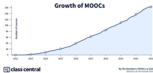
Figure 2. Growth of MOOCs

Many people were drawn to online schooling as a consequence of the pandemic (see Figure 2). MOOC providers, in particular, have reaped significant benefits from their free online courses from prominent universities, which have attracted a large number of students [5].